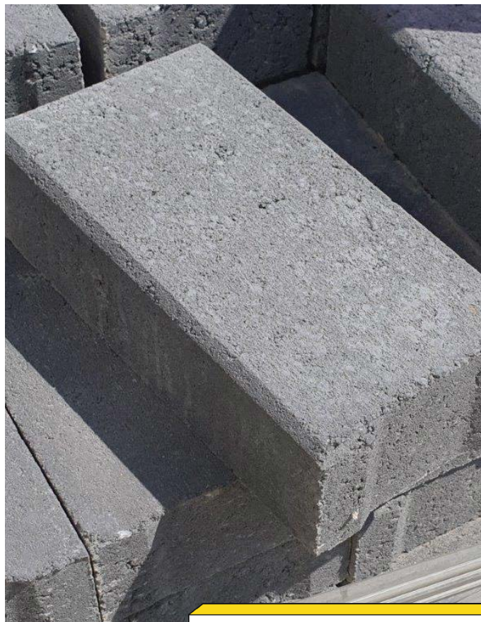
Permeable Pavers | Charcoal

*Colours are an indication only and may differ