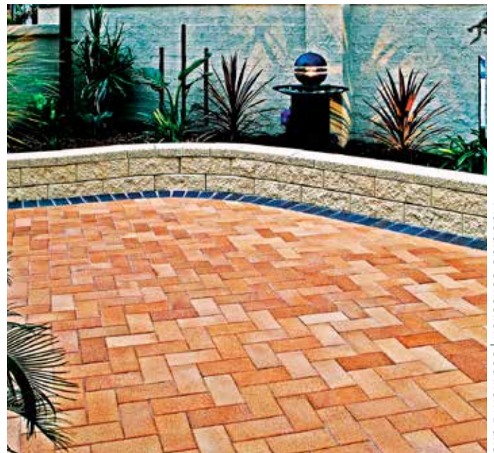
Adelaide Collection | Southern Dune

Bullnose and copers also available upon request