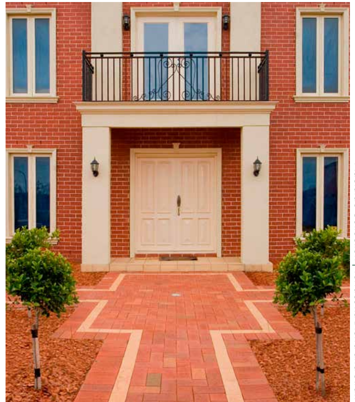
Adelaide Collection | Terracotta Blend and Straw