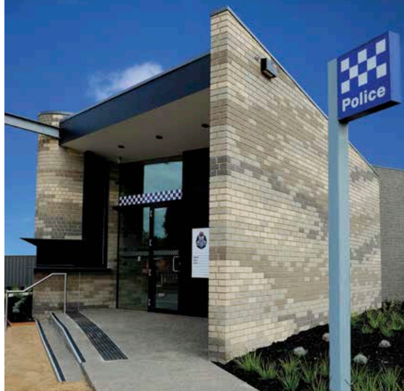
The Axdale Police Station used 15,000 of Adbri Masonry's Coloured Architectural Bricks in both honed and shotblast finishes.

To request your own brick sample pack call 1300 365 565 or email us at enquiries@adbrimasonry.com.au